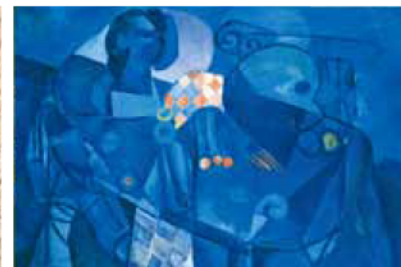
Still-Life, Blue by Imanishi Chutsu