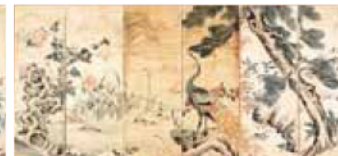
Phoenix and Peacock by Nakayama Koyo