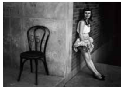
Chicago, Child by Ishimoto Yasuhiro, 1959-1961