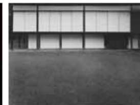
Katsura Imperial Villa - Shingoten and Lawn Garden by Ishimoto Yasuhiro, 1954

© Kochi Prefecture, Ishimoto Yasuhiro Photo Center